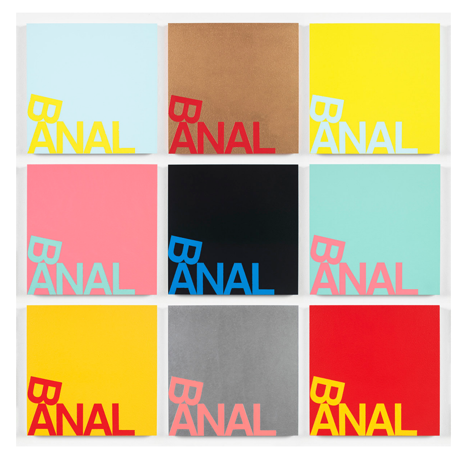
Grid of bANAL (2014) paintings, each acrylic on gessoed wood panel, 12 x 12".