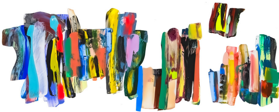
TBV Collage #16, 2021. Mixed media on paper. 32 x 77"