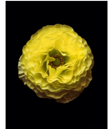
Ranunculus Golden Eye , 2010 Flex chromogenic print. 26 1/4 x 22"