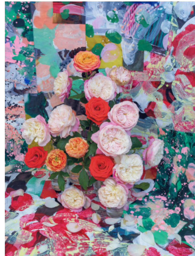
Garden Rose Splatter (Baroquecoco Series) , 2018 Flex chromogenic print. 48 x 36"