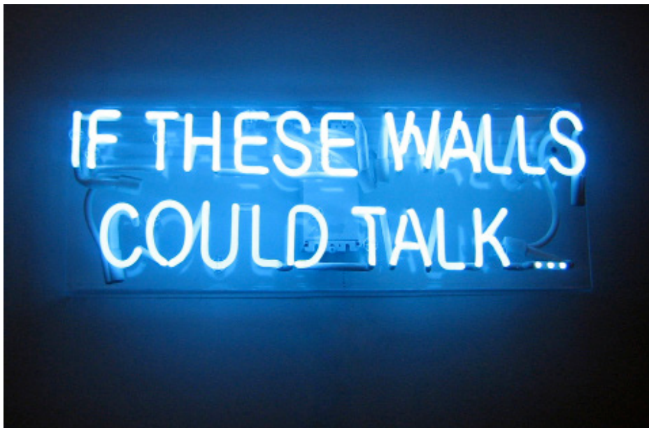
If These Walls Could Talk , 2011. Neon (mounted on plexiglass). 9 1/2 x 30 x 5". Edition 30.