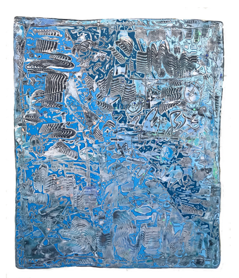
Ice Cold, 2019. Acrylic on wood panel. 44 x 36 x 1".

process allows for a meditative practice in a contrarily bustling environment.