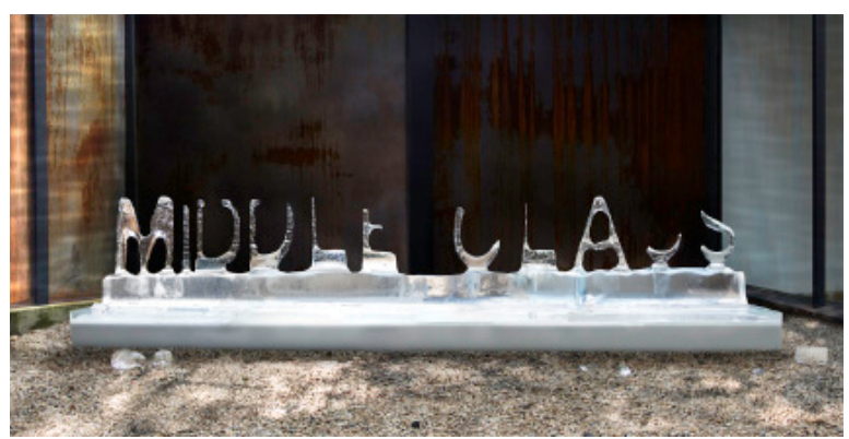
Morning in America, 2011. Ice Sculpture. 22 x 4 ft.