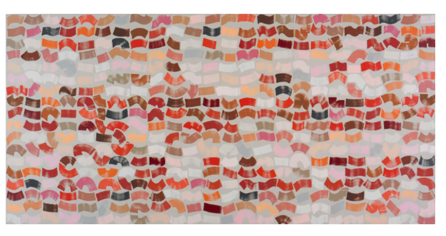
Jupiter Rising, 2012. Oil on canvas, 66 x 132"

Mayer Brown LLP, New York, NY USC Keck Medical Center, Los Angeles, CA