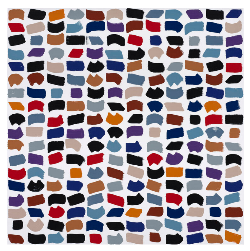
Queensbridge 5, 2019. Oil on canvas, 66 x 66"