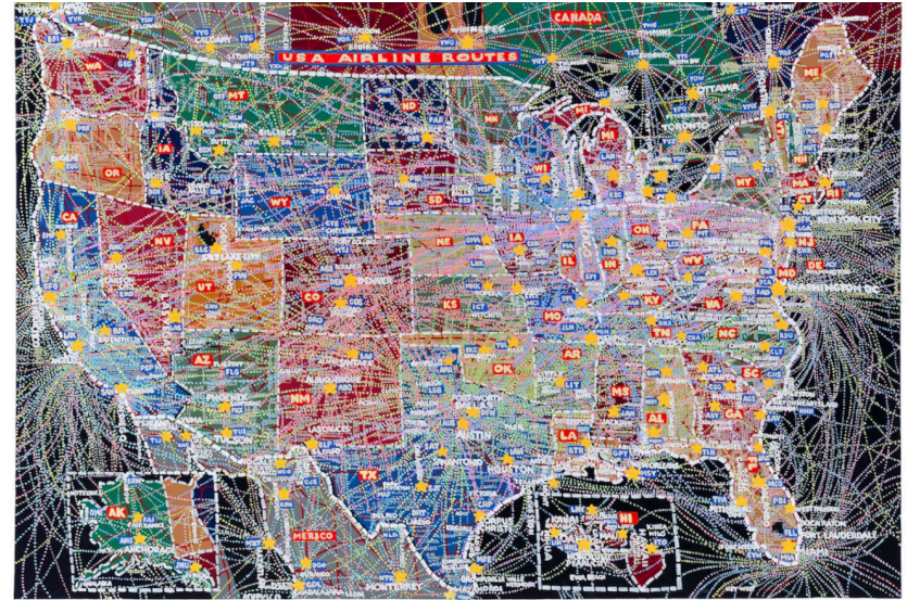
USA Airline Routes , 2020. Digital pigment print, 43 3/4 x 60", Edition of 90

Scher, Paula. Paula Scher: Maps. New York: Princeton Architectural Press, 2011 Scher, Paula. Make It Bigger. New York: Princeton Architectural Press, 2002. US paperback edition published Fall, 2005