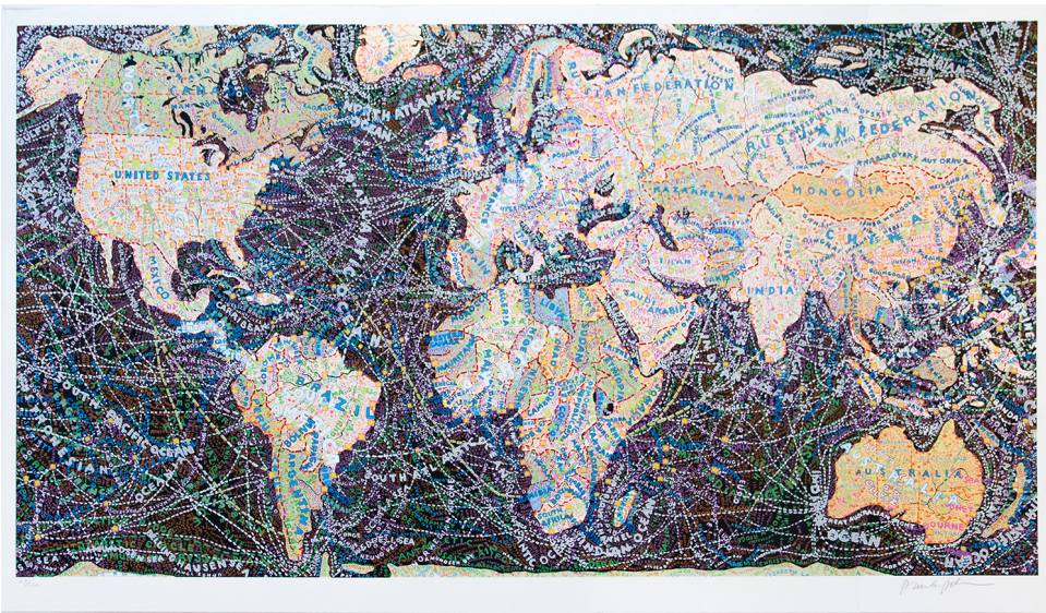
World Trade Routes, 2018. Screenprint, 34 3/4 x 60", Edition of 150